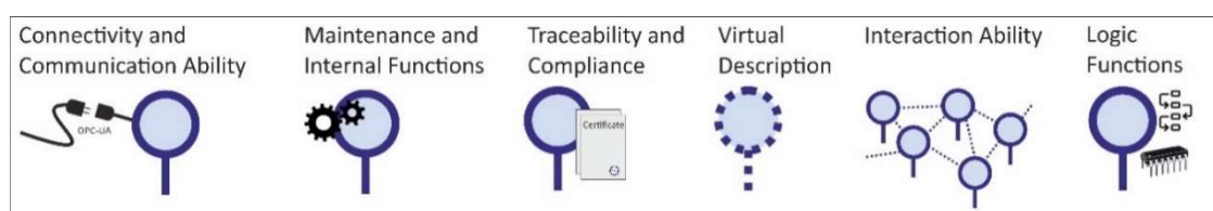
Figure 2. The most important smart functions of future process sensors according to [12].

The roadmap explained typical features of smart field devices, which are explained in Figure 2 and below. Many of these requirements have now been successfully and reliably implemented and testify to the excellent cooperation between users in the process industry and their device and software manufacturers in committees and joint projects. Digital transformation is understood by all as a management task.