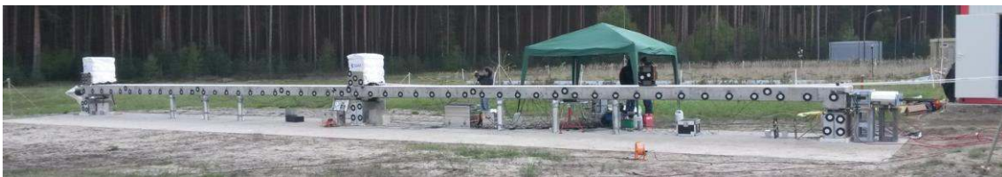
Figure 1. The BLEIB reference structure at the BAM test site.

The BLEIB reference structure is a 24 m long post-tensioned concrete beam on three supports built to allow research and validation of advanced testing and monitoring concepts (Fig.1). It was built on the BAM test site technical safety close to Berlin. Static and dynamic load can be applied. Tension can be adjusted. One span was intentionally damaged.