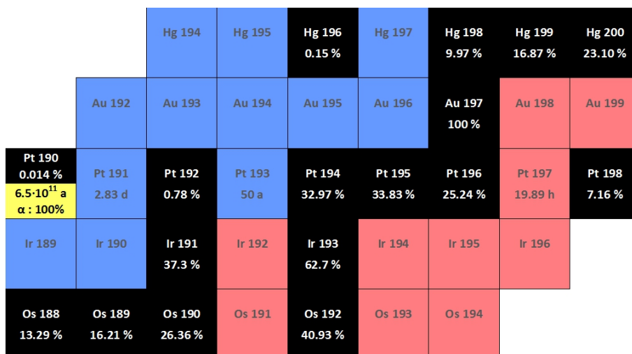
Fig. 2: Zoom of the nuclide chart to show the Pt isotopes together with isobaric interferences

^{190}\text{Pt} and ^{192}\text{Pt} are interfered by Os isotopes, while ^{196}\text{Pt} and ^{198}\text{Pt} are interfered by Hg isotopes (Fig. 2). The remaining isotopes ^{194}\text{Pt} and ^{195}\text{Pt} are equally high abundant. ^{195}\text{Pt} is selected as the natural reference isotope and ^{194}\text{Pt} is selected as the spike isotope.