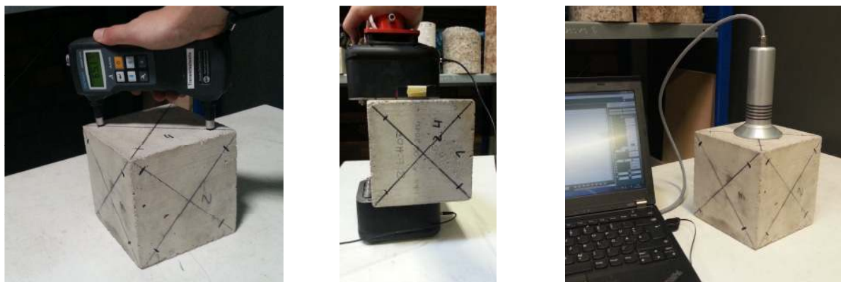
Figure 1. Photo of the cubic concrete samples during measurements with the UK1401 (left) for ultrasonic surface velocity measurements; with the A1220 (center) for the ultrasonic bulk velocity measurement and with the microwave R1 sensor (right) for the measurement of changing electromagnetic properties.

In the second part of the experiment we intended to discriminate the effect of hydration (which could not be regarded as fully completed after the 28 days of curing under water) from the mere influence of moisture change. To this end the specimen were re-saturated in a desiccator when they were about 160 days old. Subsequently they were dried again in the climate chamber and all ndt measurements were repeated at regular intervals. The results of the two experiment cycles (1: hydration or “hydr.,” 2: saturation or “sat.”) are compared and discussed.