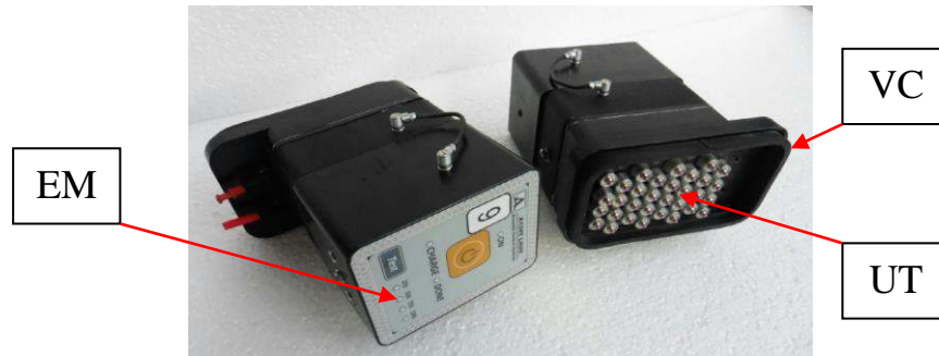
Figure 1: One ultrasonic unit of the LAUS system. Each Module consists of 32 dry point contact transducers which are spring loaded and ensure the mechanical contact to the concrete surface. Ultrasonic (UT) module, electronic module (EM), vacuum case (VC).

The UT module consists of 32 ultrasonic DPC transducers. They have each one electrical connector to the electronic unit, all 32 transducers simultaneously transmit or receive ultrasound.