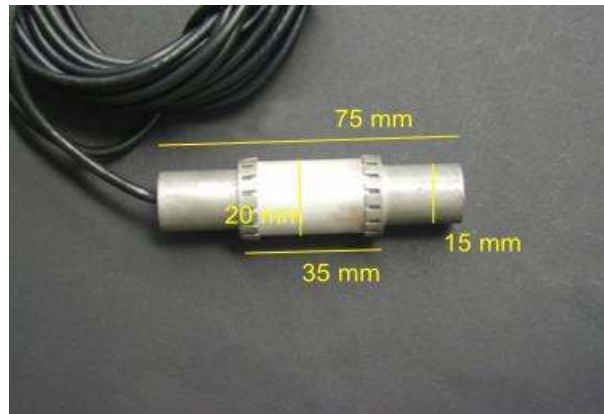
Figure 1. Sensor SO807

New ultrasonic transducers (“SO807”) have been designed by Acsys Ltd., Moscow, Russia in cooperation with BAM [1]. The main part is a hollow piezoceramic cylinder of 20 mm diameter and 35 mm length. The electric connections are on the inside. On both ends metallic pieces are clamped to the piezoceramic part. The outer diameter of 15 mm allows stacking of several transducers along a line using standard PVC tubes. Having all cables inside ensures good coupling of the piezo to the concrete and protects the electrical connections during installation. The total length of the transducer is 75 mm.