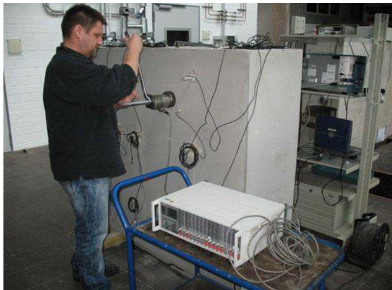
Figure 3. Concrete specimen GK32 with embedded transducers and load application system. From [2].

From literature it is known that the velocity of ultrasound changes with stress applied to the medium through which the ultrasound travels. Therefore ultrasonic measurement systems can be used as stress (change) indicators. This could be demonstrated by a laboratory experiment [2]. A concrete block had been equipped of 18 ultrasonic transducers. In the upper half of the concrete block a hole was drilled to insert a thread bolt. Nuts, 10·10 cm 2 load distributing plates and a piezo load cell provided a way to introduce localized compressional stress in a controlled, repeatable way (Figure3). Load steps of 5 or 10 kN were applied in various cycles up to a maximum load between 20 and 100 kN, more than one order of magnitude below the compressive strength of the concrete.