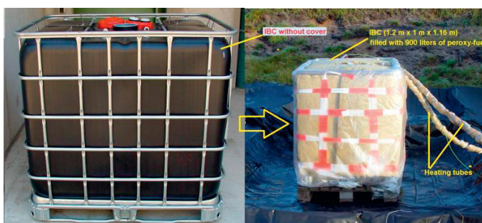
Figure 1. Typical IBC (1000 l capacity) and set-up for performing the test

After about 10 hrs a substance temperature of 89 °C was reached. The peroxy-fuel starts to decompose releasing gaseous products and, finally, one hour later an explosion occurs connected with bursting of the IBC and formation of a fireball. Heat flux sensors and video cameras were used to measure the thermal radiation, fireball diameter and elevation, respectively [20].