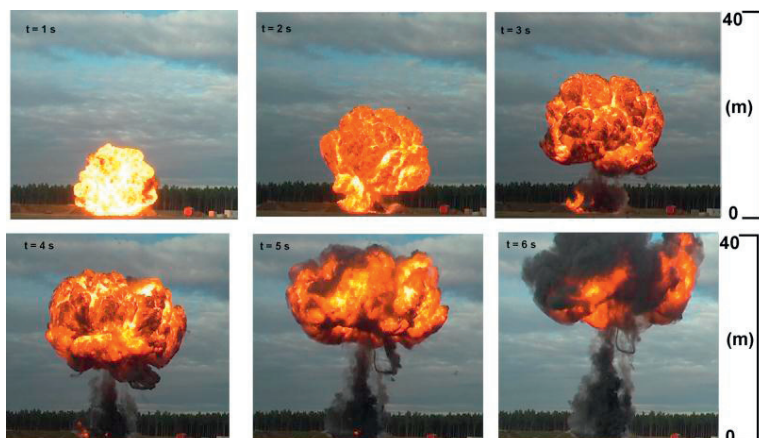
Figure 2. Time-dependent evolution of the fireball after the explosion.

The evolution of fireball with time after the explosion is shown in Fig. 2. The measured average diameter and elevation using the video images were 28 m and 35 m, respectively, which were however over predicted by the usually used equations [4] for liquid hydrocarbons. Since peroxy-fuel vapors receive additional heat from decomposition and get some oxidizer from the molecule itself they burn faster. As a result fireball was not risen to the similar elevation like hydrocarbons and exhibited smaller overall diameter. Due to the fast combustion and relatively smaller soot production peroxy-fuels show higher flame temperatures and thermal radiation than hydrocarbons. The measured thermal radiation at 100 m from the IBC was 4 kW/m 2 whereas at 225 m it was 0.8 kW/m 2 .