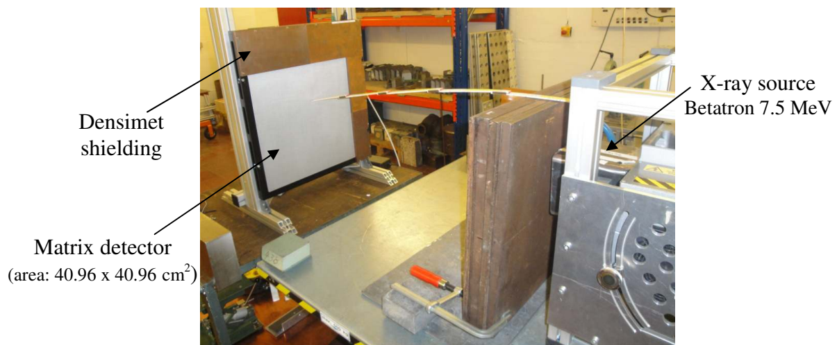
Figure 1. Preparation of experimental setup with DDA and Betatron

The EN ISO 17636-2 standard describes the compensation principle (II), which allows to compensate the underperformance on basic spatial resolution (missing duplex wire pairs) by an increase of the contrast sensitivity (better single wire IQI detection), but only up to a certain point.