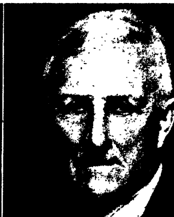
Eric Fromm and G. N. M. Tyrrell—“new insight into our nature.”